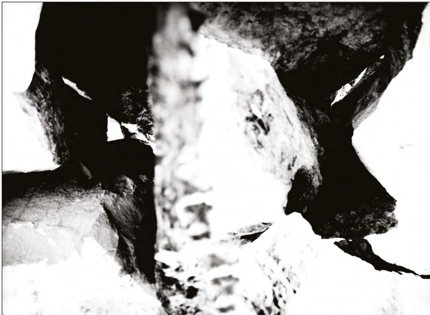
Two eyes and a tongue