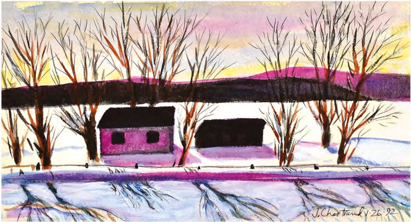
JOCKO CHARTRAND. Petite scène d'hiver - Lac Whitewater AZILDA, 1.26.92. Encre, acrylique + aquarelle. 15.7 x 28.3 cm. Collection de l'artiste.