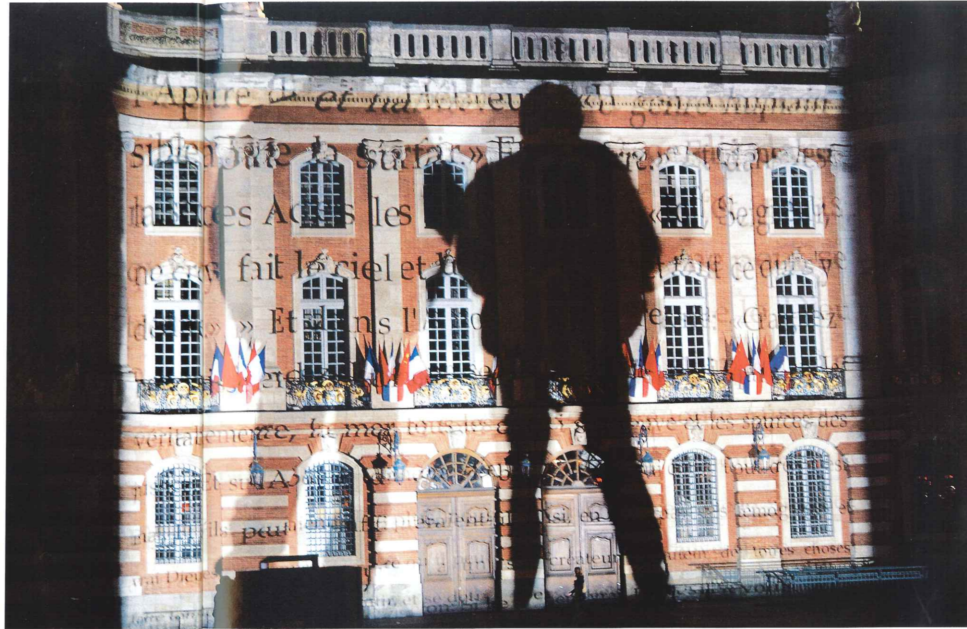
Two Origins, Relational Architecture 7 2002 Heretical texts revealed by the projected shadows of passersby, utilizing robotic xenon projectors and computer control. Installation at Place du Capitole, Toulouse, France

Do you see your work within the light of the increased utopian aspects of new media? Well, no. I do love utopian ideals and romantic scenarios, and I think it is important to come up with beautiful hypothetical constructions. However, these constructions usually crumble when it is time to get involved in the dirty world of politics and logistics and misinterpretation and hormones. Most utopian models, when they are not pure poetry, are a cop-out, as they don't deal with the intricacies of our local immediate situation. I would distance myself from utopia.