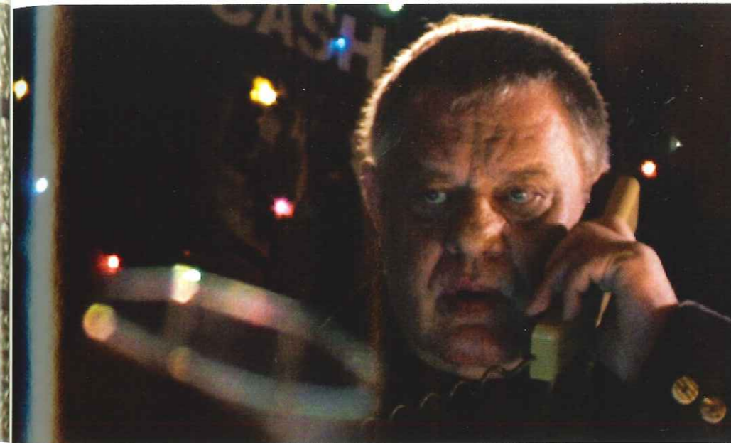
LEFT AND OPPOSITE: Janet Cardiff and George Bures Miller Video stills from The Paradise Institute 2001

hours and hundreds of kilometres remains tactile and unbroken. As in a child's game, I can connect the dots, and this makes me neither a tourist nor a pilgrim, but a traveller. And, I want to insist, it makes for a significant way of looking at art. Now, I don't know much about art either. But I do know what I like as I rummage about discovering, retrospectively, reasons to think about it, connecting the dots that accrue, as it were. It's like picking flowers and finding a bouquet—or like travelling on a train and finding myself here.