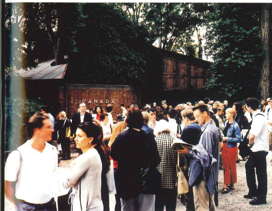
ABOVE: The Canadian Pavilion, June 2001